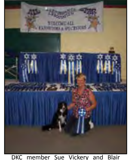
display their placement rosette in front of the official All Star trophy table prior to the Awards Ceremony.